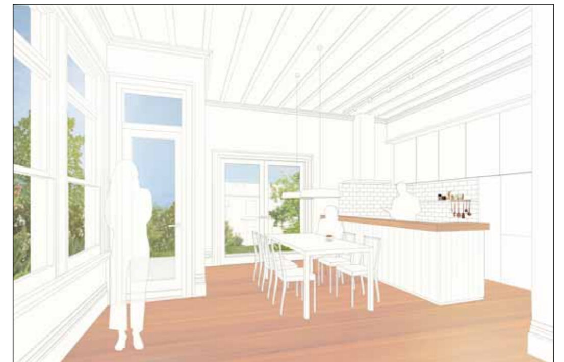
Fresh interior design in the comfort of a fully renovated grand old villa.