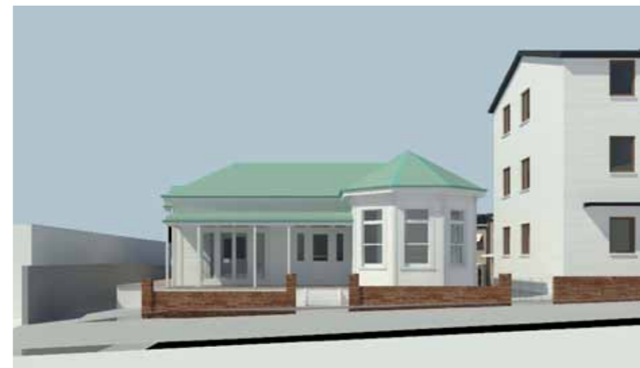
Artist's impression of the vhe villa on Browning street (without street trees)