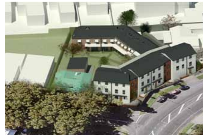
Cohousing has been shown to work internationally with a 50-year track record in countries such as Denmark, Germany, and the United States.